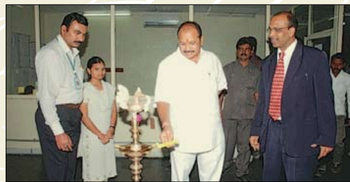
Shri Kannalaxmi Narayana, Hon'ble Minister for major industries, commerce and export promotion food processing, Government of Andhra Pradesh, inaugurated the "SAKSHAM PWD" Training Center for Jewellery Manufacturing and Diamond Processing at the Gitanjali Gems factory in the Rajiv Gems SEZ in Hyderabad.