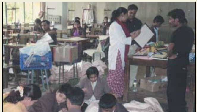
Gitanjali representative at an NGO in Mumbai

S neh is a mission undertaken by Gitanjali Group to interact with NGOs and support their initiatives on different fronts. The aim is to build relationships with organisations and individuals who are active in the field and execute projects for the upliftment of society by partnering with them. Sneh helps to reach out to such organizations in a more focused manner. Currently under Sneh the process of creating bonds with various NGOs in Mumbai, Ahmedabad, Hyderabad and other places is under way.