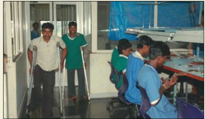
An inclusive and integrated work culture

villages in AP to identify people for recruitment.