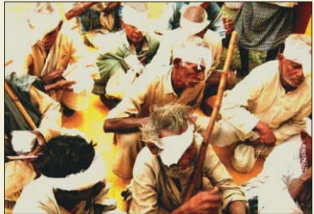
Beneficiaries of the Eye Camp

Gitanjali Group has also been a regular donor to various projects of the Cancer Patients' Aid Association of India, Save the Children India and provided them with various support and assistance