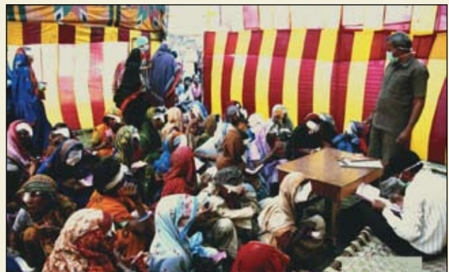
Eye Camp in Progress