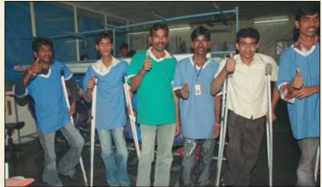
Specially enabled employees of Gitanjali Gems

In association with various NGOs and government organizations District Rural Development Authority's (DRDA) Employment Generation Marketing Mission (EGMM) and Rajiv Udyogisri, the employment scheme of Government of AP, Gitanjali has been organizing job melas in the remotest of the