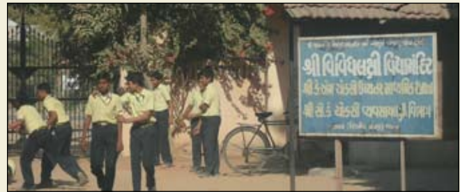
K.M. Choksi Higher Secondary School, Palanpur

The Gitanjali Group assists in the running of this institution which offers a unique system of integrated and inclusive learning by providing education to normal and especially abled children in the same class. Education, food and accommodation are free for the PWD's. Almost 50% of the students are female.